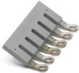
Insertion bridge, pitch: 9 mm, number of positions: 6, color: gray

Please be informed that the data shown in this PDF Document is generated from our Online Catalog. Please find the complete data in the user's documentation. Our General Terms of Use for Downloads are valid ( http://phoenixcontact.com/download )